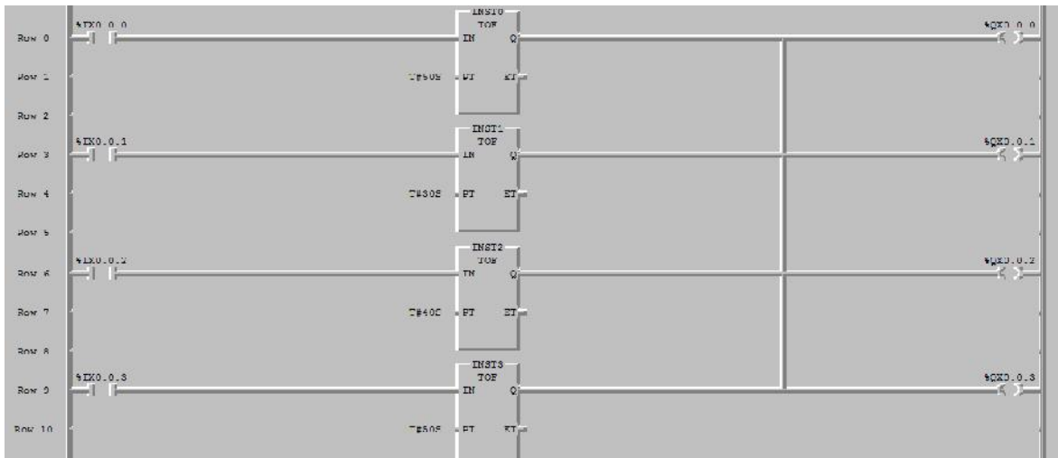
2 μ μ Ladder